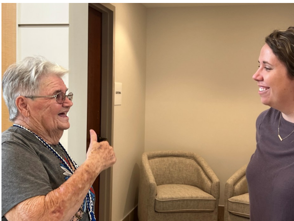
New Home and Old Friends!